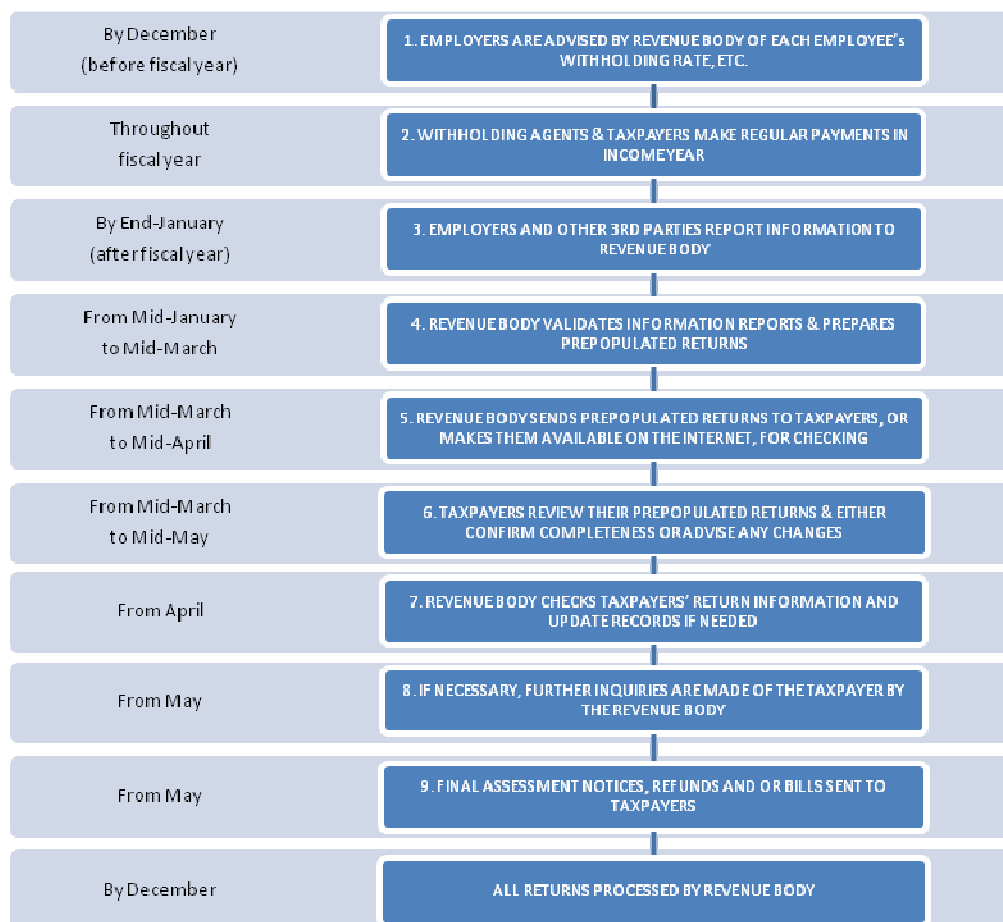
Figure 1: Overview of pre-populated return systems used by Nordic region countries (Fiscal year is the same, i.e. the calendar year, in all the surveyed countries, although timelines may vary from country to country)